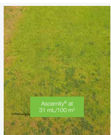
Application date: May 22